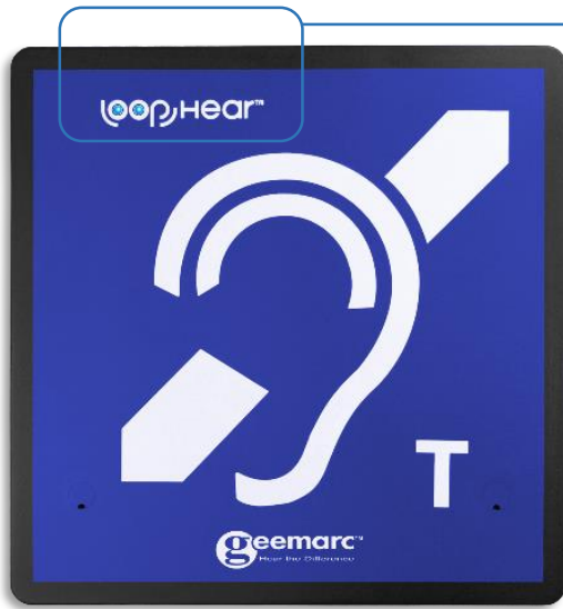
Visual indicator (Blue LEDs)